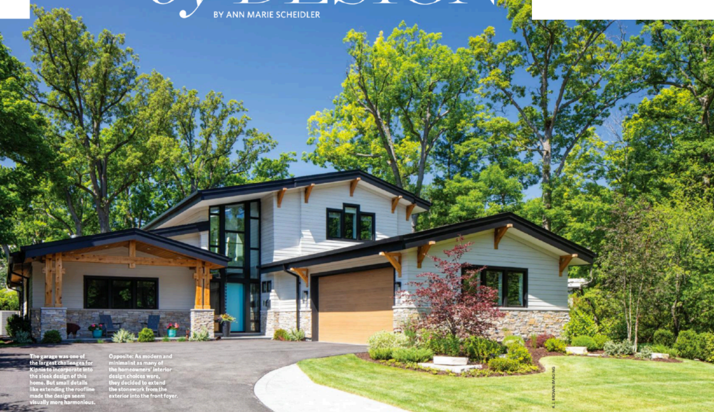
The garage was one of the largest challenges for Kipnis to incorporate into the sleek design of this home. But small details like extending the roofline made the design seem visually more harmonious.

KIPNIS ARCHITECTURE AND PLANNING NABBED THE TOP SPOT IN BETTER'S BEST OF 2019 AWARDS IN THE HOME & DESIGN CATEGORY. HERE, THE FIRM SHARES ONE OF THEIR MOST IMPRESSIVE PROJECTS.